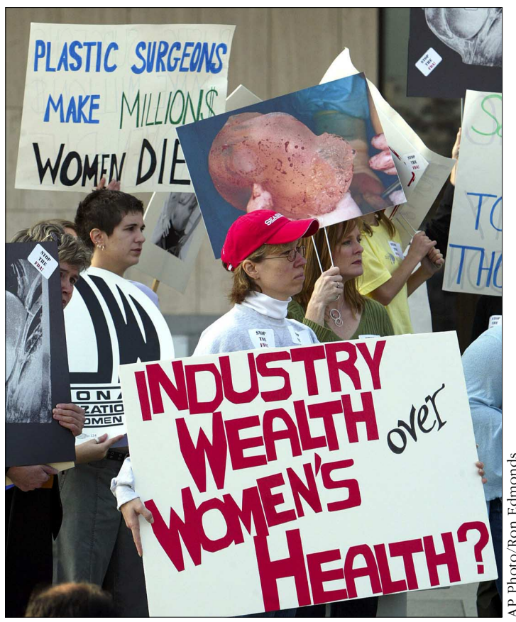
Protesters opposed to silicone breast implants rally outside the Department of Health and Human Services on Oct. 8, 2003. The Food and Drug Administration banned them for most women in 1992 after widespread reports that they caused health problems. An FDA panel recommended against lifting the ban after holding hearings in April 2005.

In 2004, Fox launched a knockoff, "The Swan," which puts its newly transformed participants in a beauty pageant. And MTV's "I want a Famous Face" seeks out people who want to resemble a star and follows them through