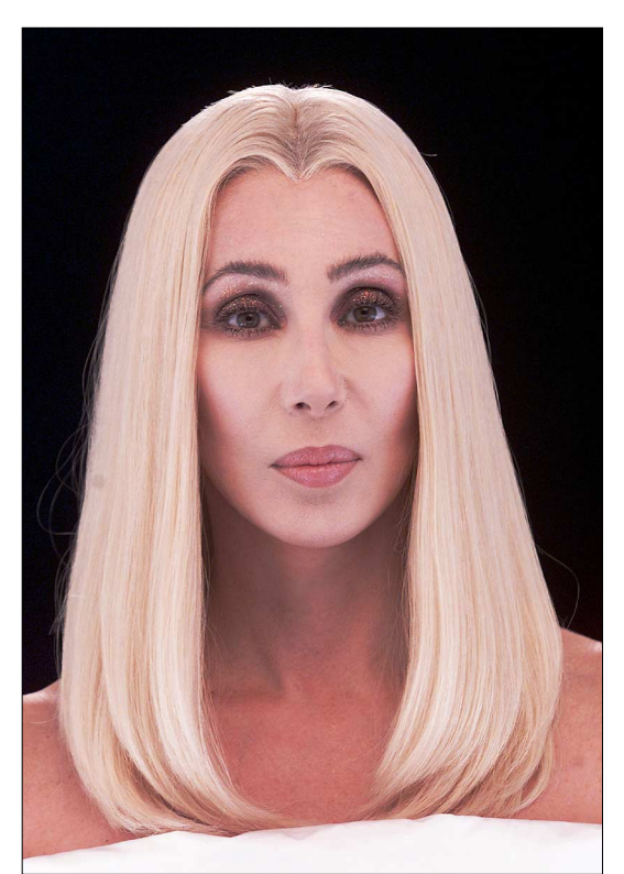
Superstar Cher, known as the "plastic surgery poster girl," says Hollywood gossip exaggerates the number of cosmetic procedures she has undergone. She turns 59 in May.

RECIPIENT OF SOCIETY OF PROFESSIONAL JOURNALISTS AWARD FOR EXCELLENCE ◆ AMERICAN BAR ASSOCIATION SILVER GAVEL AWARD