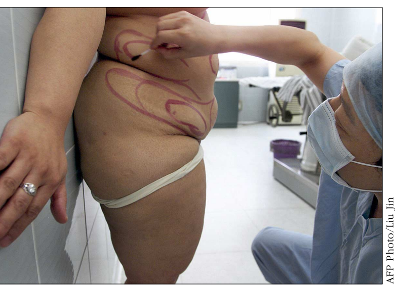
A Chinese doctor prepares for a liposuction operation at a hospital in Shanghai in August 2002. Many Chinese women and men now get cosmetic surgery despite the relative expense and possible health risks.

In addition to regulating who can perform cosmetic surgery, some states are considering a "vanity" tax on the procedures, although plastic surgeons and their patients, who would pay the tax, are opposed. In September 2004, New Jersey became the first state to levy a vanity tax on cosmetic surgery. The 6 percent tax is expected to bring in $25 million per year. The funds will compensate hospitals that care for uninsured patients. The American Society of Plastic Surgeons has criticized the new tax as a "dangerous precedent." 29 But hospital associations favor it.