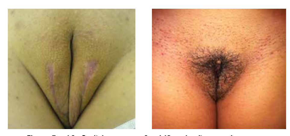
Figures 7 and 8 - Genital appearance 6 and 12 weeks after second surgery.